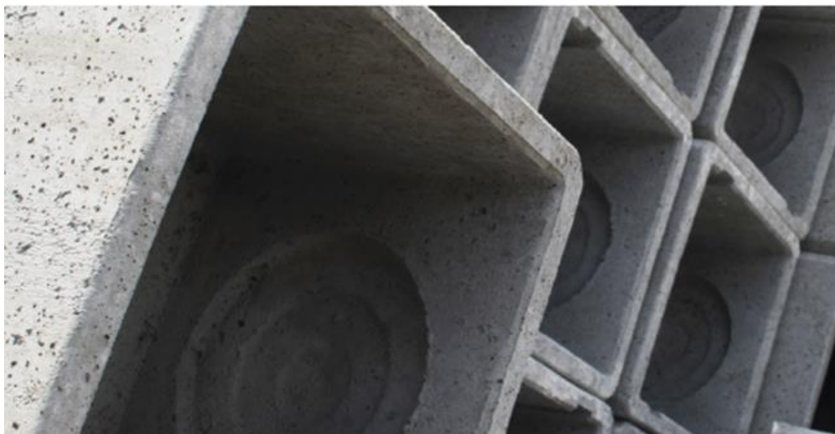
Example of product made from the products analysed

Graphene is a bidimensional material formed by carbon atoms attached each other into sp^2 bonds, creating a characteristic honeycomb structure. Graphene-based materials are products which have similar structure than graphene. This similarities in the structure leads to characteristics and properties very close to those of pristine graphene and can therefore be used as substitutes to it. These materials can exhibit very good mechanical characteristics, as well as electrical, thermal and even antibacterial properties. It is the mechanical properties that improve the mechanical performance, quality and performance of admixtures and products for construction.