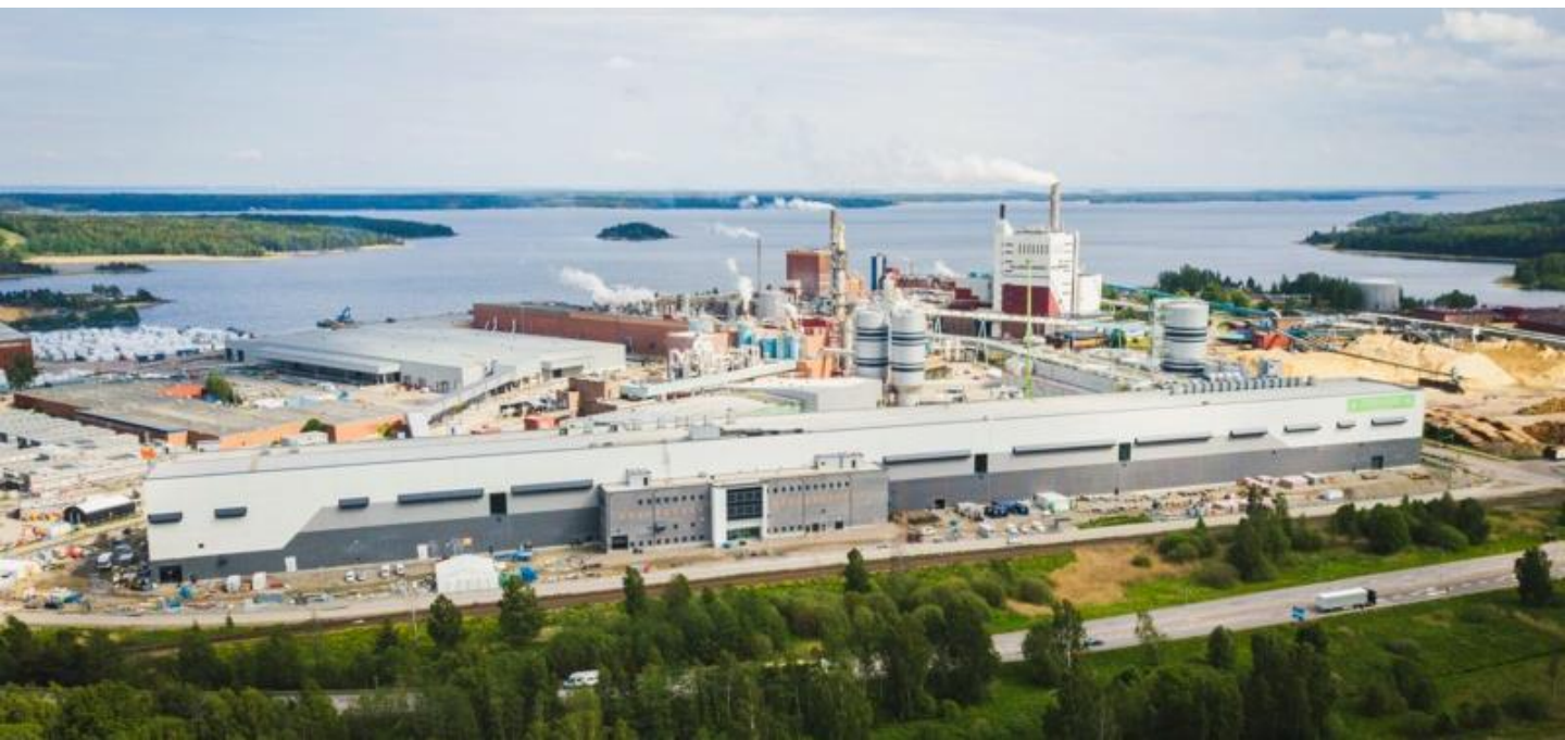
GRUVÖN – THE PRODUCTION SITE FOR PURE PERFORMANCE 135gsm

The product is manufactured from virgin fibres with addition of chemicals that meet the relevant demands in EC, FDA and BfR, and in accordance with good manufacturing practice. For further information please contact us at Billerud.