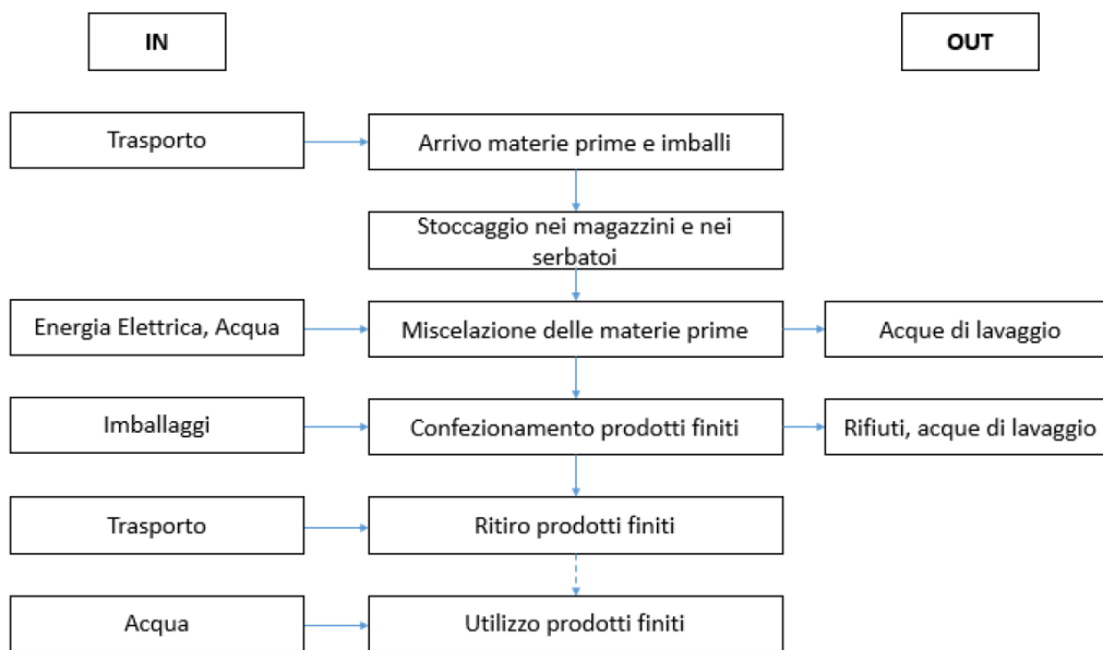
Figure 2: Flow chart of the production cycle.

During the use phase of the products, water is added to the products to make them ready for use. The composition for each of the products analyzed and the relative packaging are shown below.