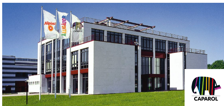
Figure 1: DAW Italia.

DAW Italia is certified with ISO 9001 in the field of quality and ISO 14001 in the field of environmental protection.