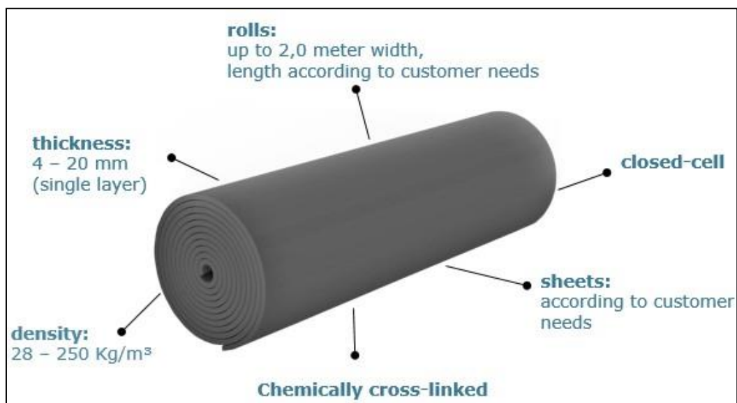
Figure 1: Chemically cross-linked PE foam main characteristics

A chemical cross-linked foam forms a resistant surface. Cross-linked closed cell polyethylene foam means that during cross-linking, the molecules connect by chemical bonds, forming a structure branched from the straight carbon chain, thus creating a more durable structure. The fineness of the cellular structure gives the material even greater stability. The cross-linked foam does not react with most chemicals, and it is not vapour-permeable. Thus, it can be used to produce a durable insulating material, as it is not consumed by insects or rodents. Its vibration damping effect is particularly high.