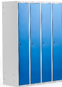
Clothes locker, flat roof