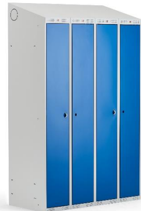
Combo locker, sloping roof