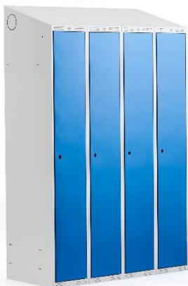
Clothes locker, sloping roof

This EPD applies to AJ Products clothes locker Classic, 4-section. High-quality clothes lockers with a welded steel frame, power coated with blue, grey or black doors. The 4-sections are available with sloping or flat roof also as a combo locker with two doors for one person with sloping roof. These lockers are highly adaptable to pair with other sizes and combinations to fit your needs and preferences. The steel-plate lockers are perfect for storing clothes and personal belongings in workplaces, gyms, schools, exhibition rooms and other public areas.