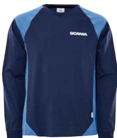
Article no 300294