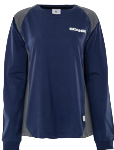
Article no 300275