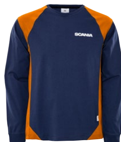
Article no 300299