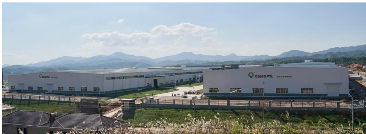
Figure 1 dasso factory in Jiangxi, China

dasso has now 8 manufacturing facilities and over 1000 employees, in addition to owning over 2,700 hectares of productive, sustainable bamboo forest in China. Besides, dasso has also established an independent R&D team with 50 people for product optimization and innovation. Up until now, 65 authorized patents, 24 innovative patents and 13 international patents have been acquired by dasso.