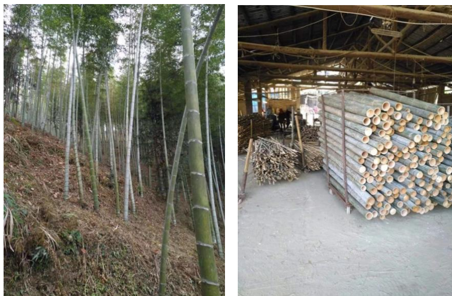
Figure 2 Bamboo culms and rough processing site near plantations

dasso Strand Woven Bamboo is a high-quality bamboo decking board with high density. It provides the natural look and feel of traditional bamboo products whilst combining excellent performance characteristics. In addition, the surface could be stained to the color of customers' choice prior to the final coating process. The possibility of color options provides the user the capability to integrate an environmentally friendly bamboo product into any design motif.