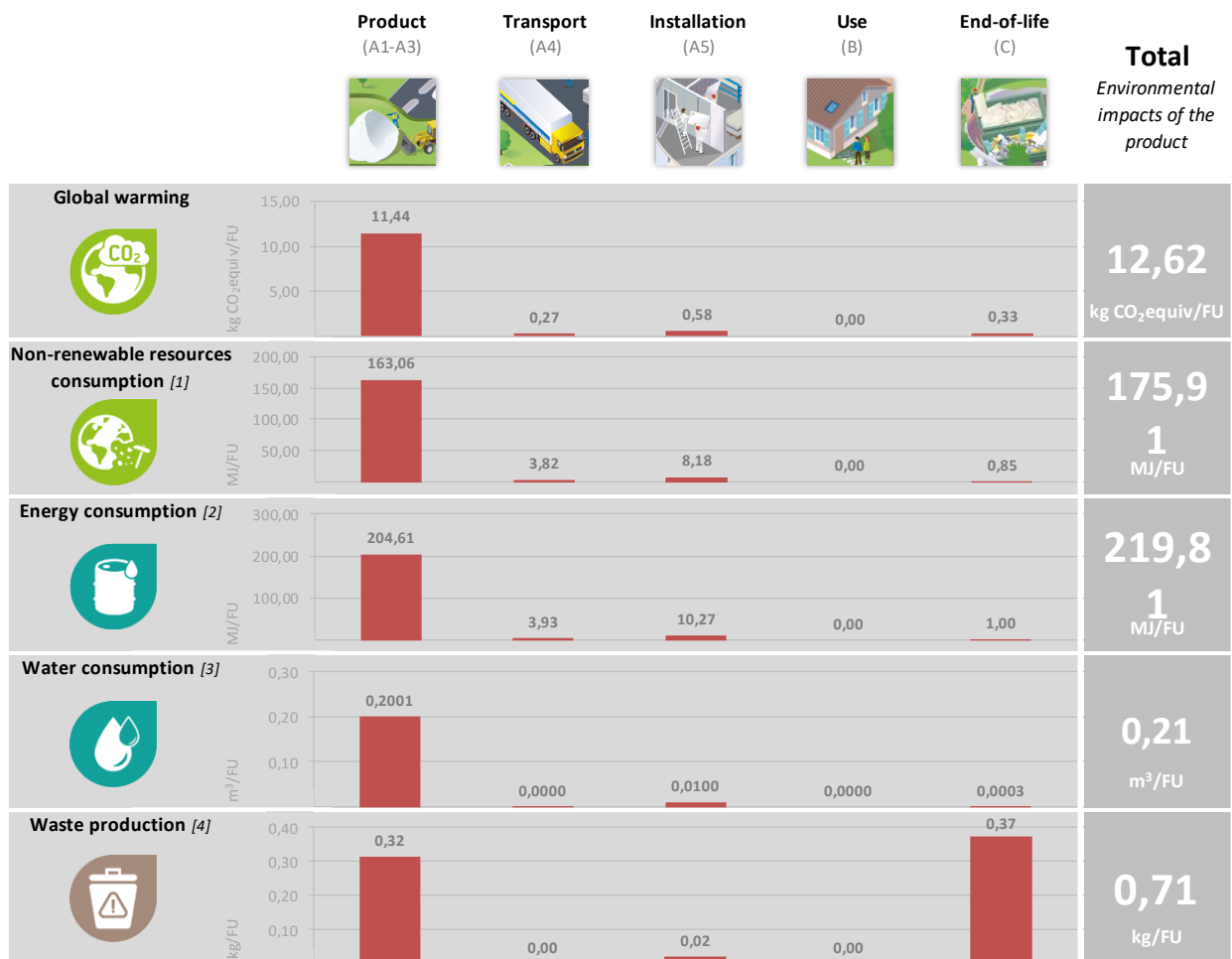
Table below presents a part of the environmental indicators results. The table enables to have a quick and synthetic overview of environmental footprint of the functional unit (1m of Saint Gobain PAM GLOBAL® PLUS cast iron pipe system for collection and drainage of waste water, sewage and rainwater in buildings).

[1] This indicator corresponds to the abiotic depletion potential of fossil resources.