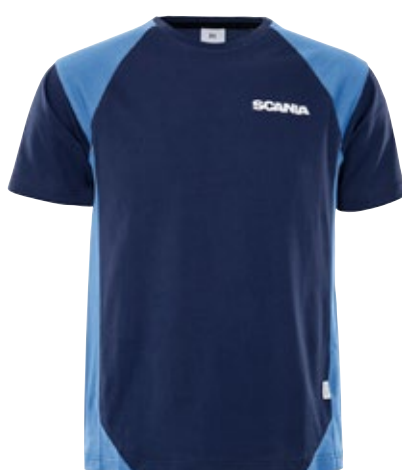
Article no 300291