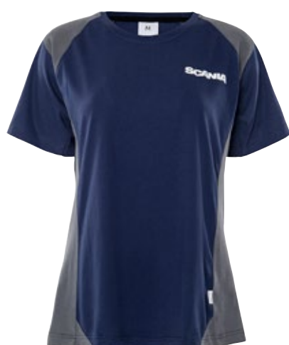
Article no 300271