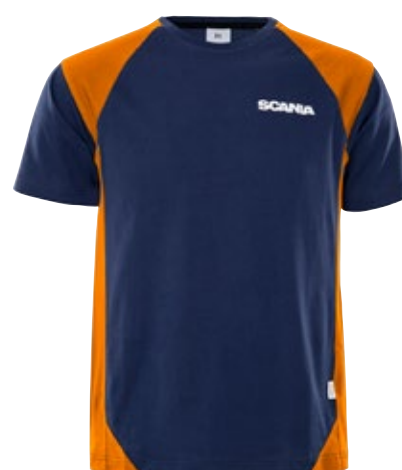
Article no 300296