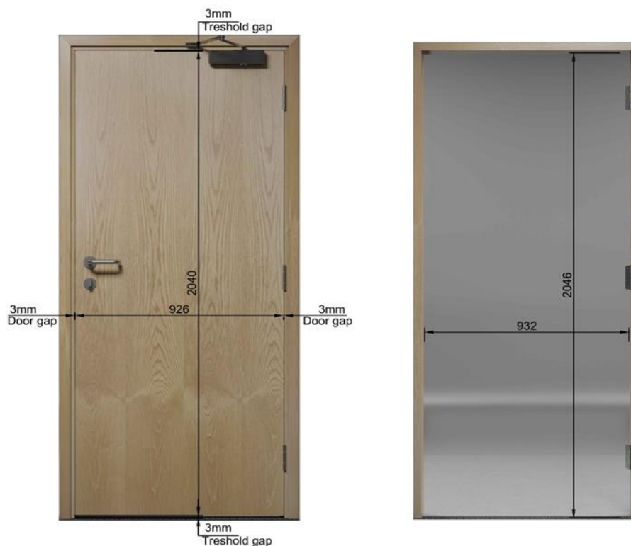
Figure 1: Dimensions of door and required door frame

Declared unit: The declared unit is 1m 2 of a door measuring Height 2040mm, Width 926mm, Thickness 54mm with a graduated density chipboard (GDC) core and veneer finish. This excludes any ironmongery such as door handles, hinges and closures. The size chosen is one of the most commonly purchased sizes in the UK and it is a common size used by other manufacturers across Europe. Data would not be available on the installation of the door if the sizes in the EN17213 were reported on.