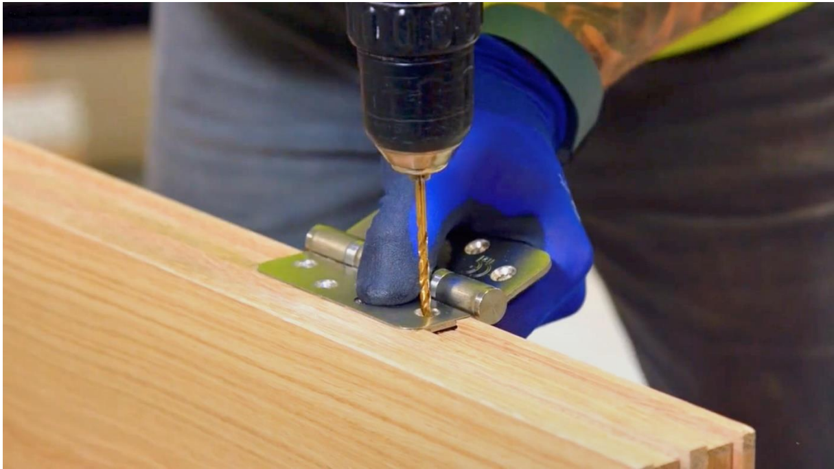
Figure 4: Generic example of fitting the hinges