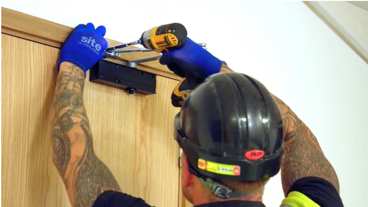
Figure 6: Generic example of installing ironmongery