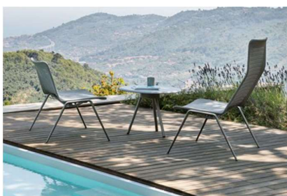
Figure 1- Explanatory picture

Fast was born in Valle Sabbia (Figure 1) in 1995 when the Levrangi family identified aluminium as the material of choice: light, versatile, ductile and sustainable because it can be recycled indefinitely. The company chooses to develop 100% outdoor products designed to be durable over time, resistant to atmospheric agents and completely waterproof. Thanks to the collaboration with Robby and Francesca Cantarutti, the Forest collection, still the company's bestseller, made its debut in 2007. Instead, it is the intuition of Studio Lievore Altherr in Barcelona that leads to experience, ten years later, a new sensuality of aesthetic lines and above all new, sophisticated materials. The focus is also on customization: the skills in aluminium processing, combined with rigorous internal production and authentic Made in Italy, allow for a wide range of customizations in terms of sizes, colours and finishes. Fast's Outdoor Lifestyle is expressed in all its forms: not only the garden, the patio facing the sea, the large park, but also the squares, the city streets, the terraces of megacities surrounded by skyscrapers. It is a nature that we are committed to protecting, in a concrete approach to sustainability: this is why we involve the entire supply chain in continuous research, aimed at increasing the longevity of products and reducing their impact throughout the life cycle.