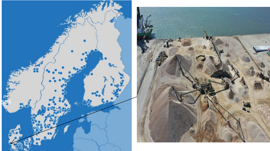
Figure 2: Map and picture showing the geographical location of the declared site.