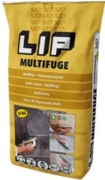
Figure 1: Picture of the eight LIP products covered in this project report.

LIP Multi Grout Manhattan, LIP Multi Grout Grey, LIP Multi Grout Antracite, LIP Multi Grout Jasmin, LIP Multi Grout Pearl, LIP Multi Grout Sand, LIP Multi Grout White, LIP Multi Grout Black.