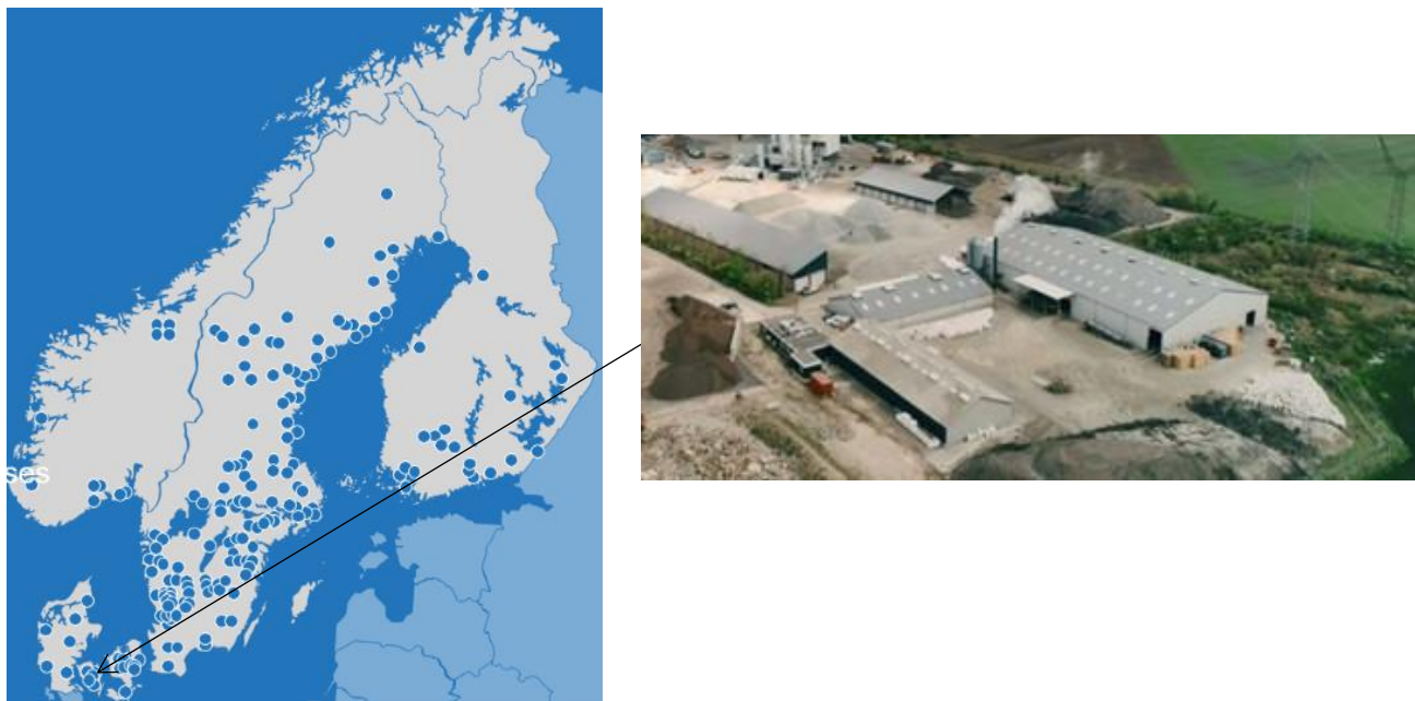
Figure 2: Map and picture showing the geographical location of the declared site.