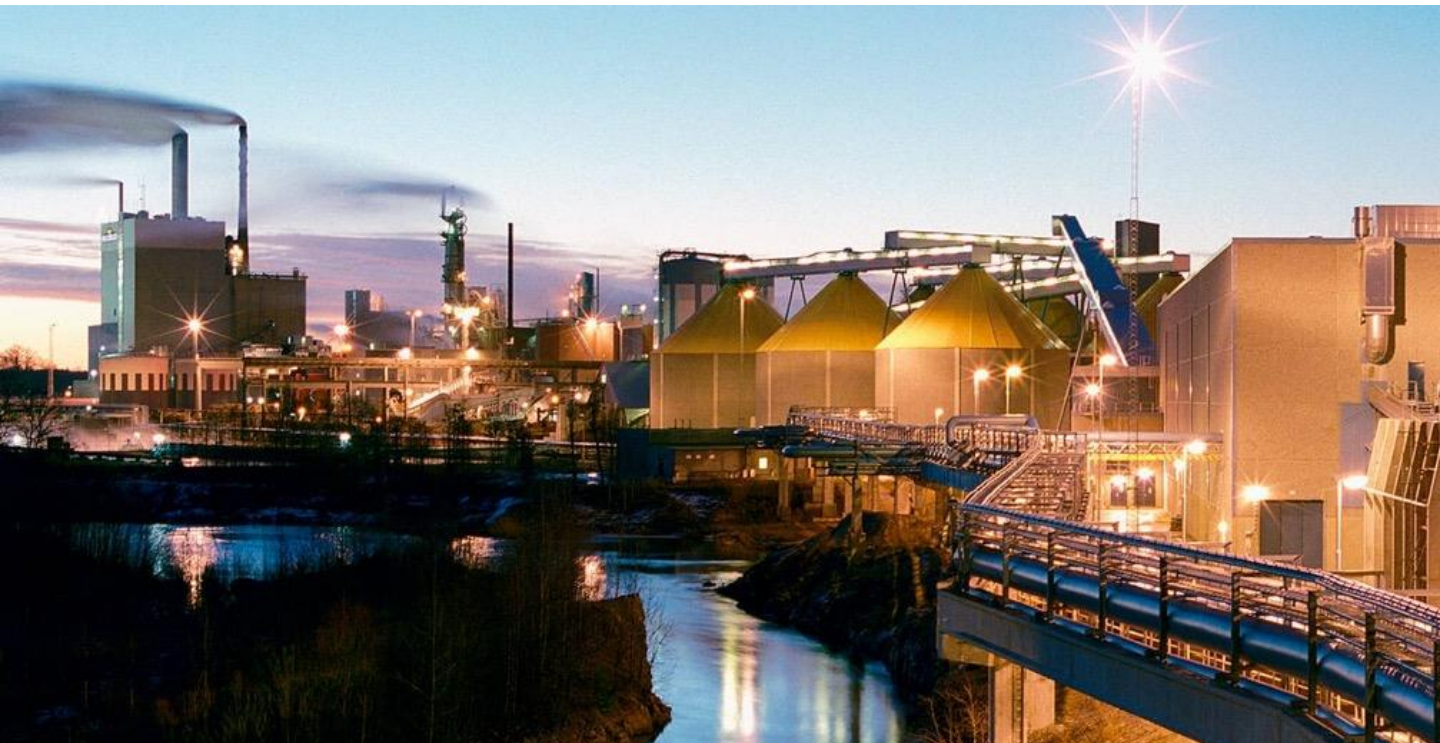
SKÄRBLACKA PM10 – THE PRODUCTION SITE FOR Xpression Glaze

The product is manufactured from virgin fibres with addition of chemicals that meet the relevant demands in FDA and BfR, and in accordance with good manufacturing practice. For further information please contact us at Billerud.