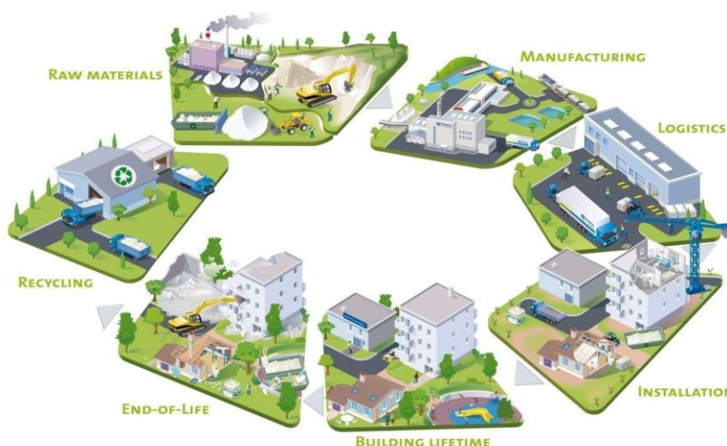
Figure 1 - Flow diagram of the life cycle stages from raw material extraction (A1) through to end-of-life

Figure 1 (below) is a flow diagram illustrating the system boundary from A1 - C4. Module D has not been modelled in this EPD. Biogenic carbon has not been included in the system boundary.