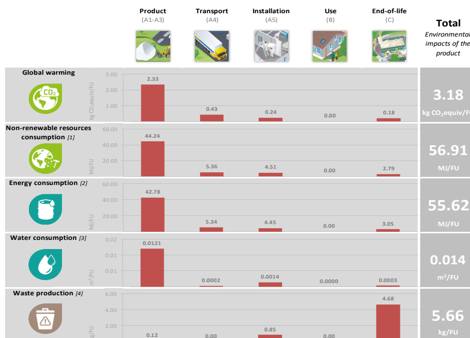
Figure 2: A summary graph illustrating the impact of 1 m2 of product (FU)

Reading example: 9,0 E-03 = 9,0*10 -3 = 0,009