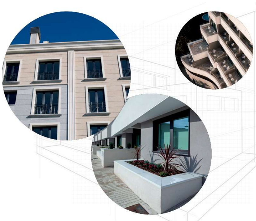
Examples of Architectural Precast solutions

ULMA also offers customised solutions in shapes, dimensions, and textures.