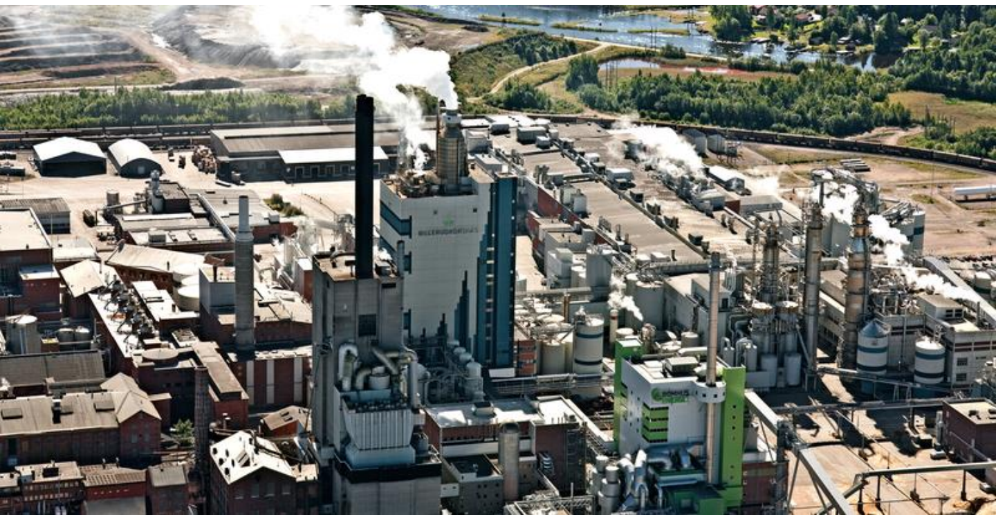
GÄVLE MILL – THE PRODUCTION SITE FOR PURE DÉCOR 120gsm

The product is manufactured from virgin fibres with addition of chemicals that meet the relevant demands in FDA and BfR, and in accordance with good manufacturing practice. For further information please contact us at Billerud.