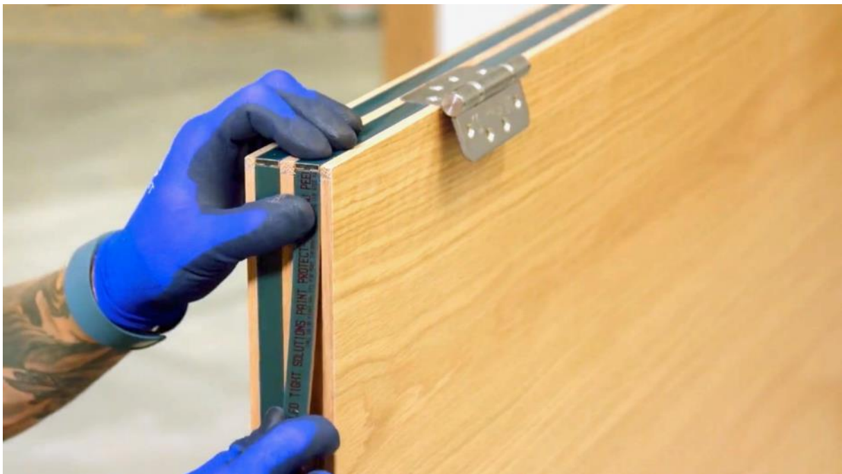
Figure 5: Generic example of fitting intumescent strip