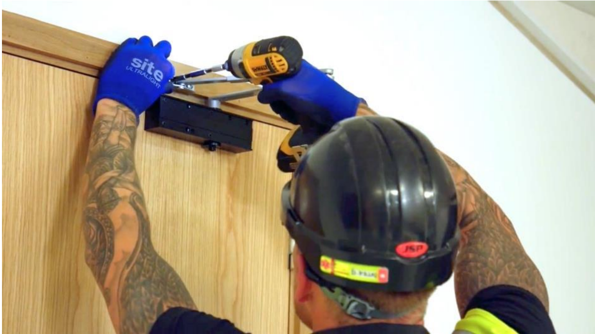
Figure 6: Generic example of installing ironmongery