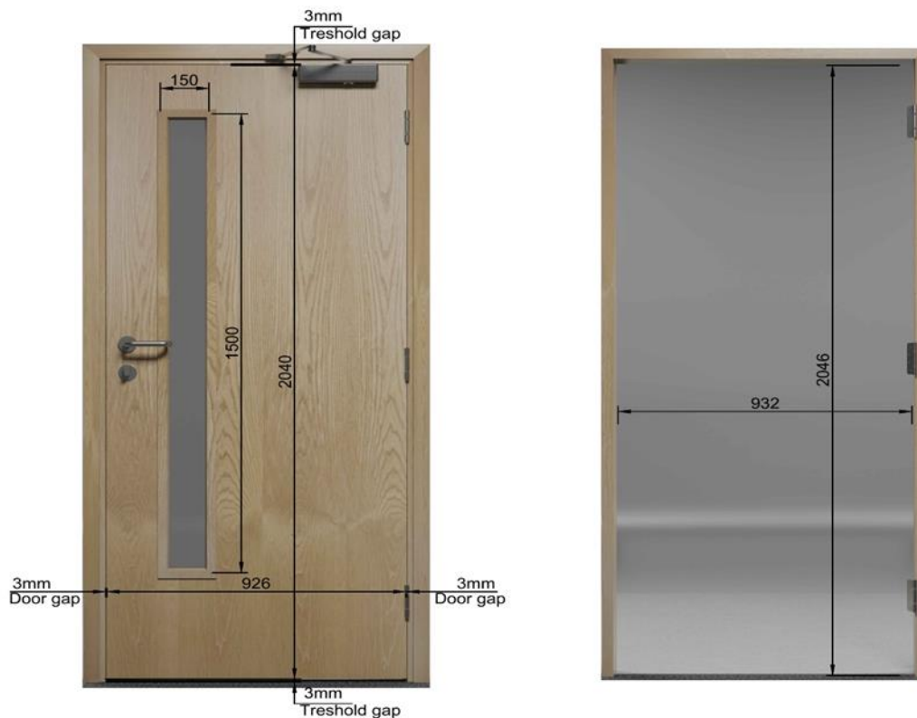
Figure 1: Dimensions of door and required door frame

ironmongery such as door handles, hinges and closures. The size chosen is one of the most commonly purchased sizes in the UK and it is a common size used by other manufacturers across Europe. Data would not be available on the installation of the door if the sizes in the EN17213 were reported on.