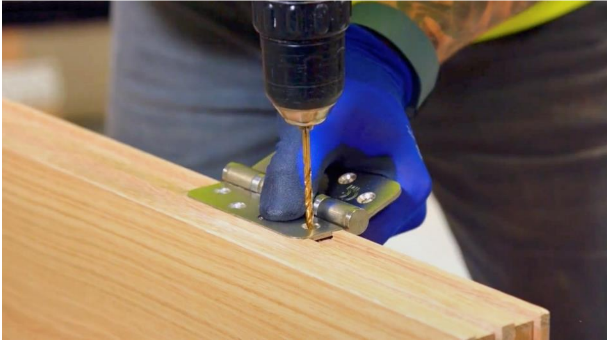
Figure 4: Generic example of fitting the hinges