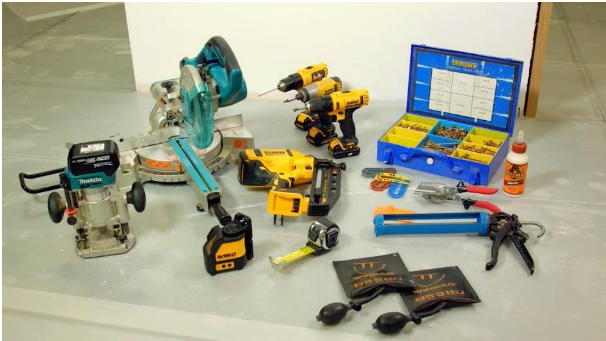
Figure 3: Section of tools required to fit a FD60 door.

To insure the correct installation of the door please follow the instruction at https://www.forza-doors.com/media/168306/forza_za_door_installation_guide_fd30-60_pdf.pdf