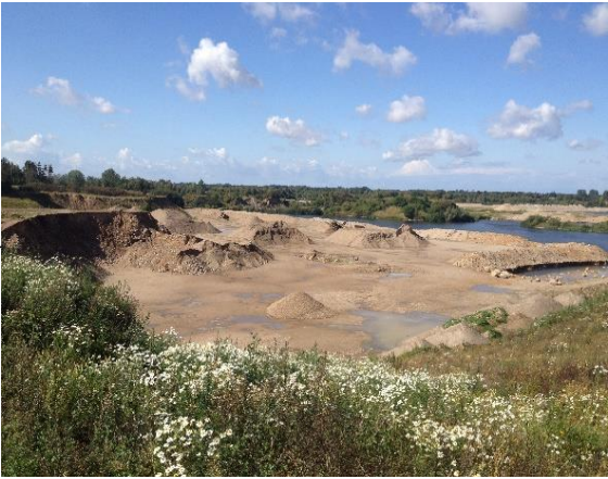
Figure 2: Map and picture showing the geographical location of the declared site.