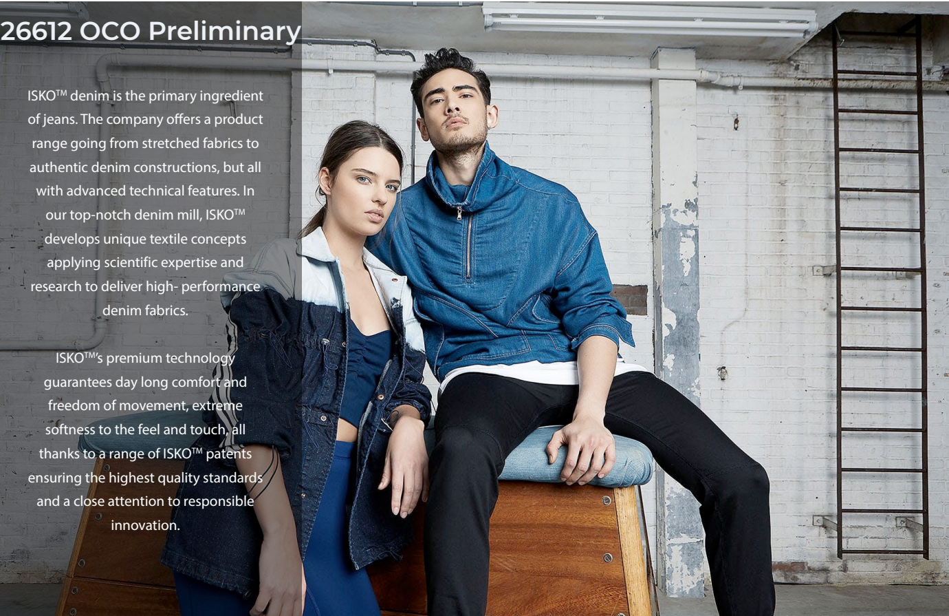
26612 OCO Preliminary

ISKO™ denim is the primary ingredient of jeans. The company offers a product range going from stretched fabrics to authentic denim constructions, but all with advanced technical features. In our top-notch denim mill, ISKO™ develops unique textile concepts applying scientific expertise and research to deliver high-performance denim fabrics.