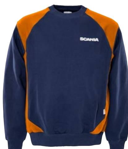
Article no 300300