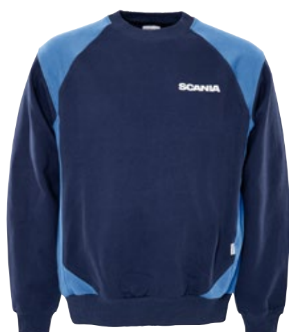
Article no 300295