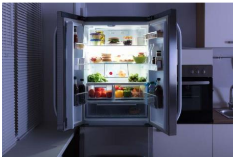
For household refrigerators