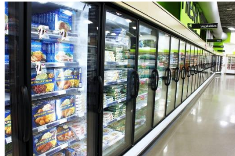
For commercial refrigeration equipment