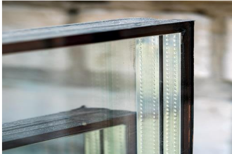
For insulated glass units