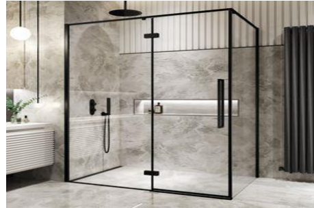
For shower cabins