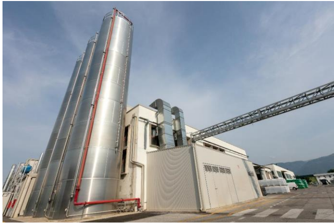
Figure 2: Manifattura Fontana S.p.A Production plant – Romano d'Ezzelino (VI)