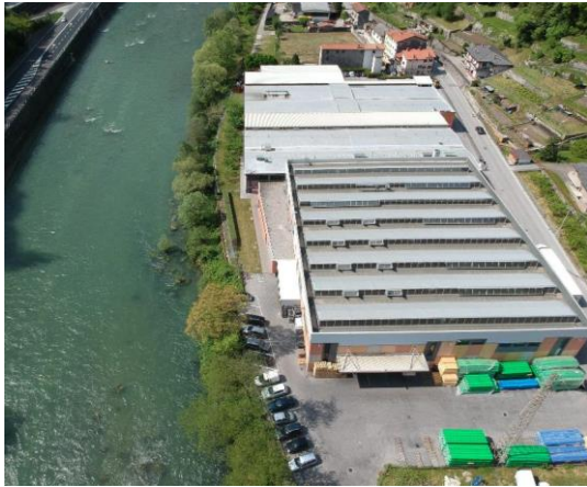
Figure 1: Manifattura Fontana S.p.A Production plant – Valbrenta (VI)

Manifattura Fontana was born in 1932, starting with the transformation of cotton fibers for technical and sanitary uses. Since 1963 Manifattura Fontana has been a leading player in the market of nonwoven fabrics and geotextiles. Since 2016 Manifattura Fontana has become partner of Sioen group, a leader in the production of yarns, technical fabrics and protective clothing. Manifattura Fontana is a leader in geotextiles market thanks to an accurate raw material choice and a continuous search for new solutions for product development, combining its experience with the solidity of a consolidated multinational group.