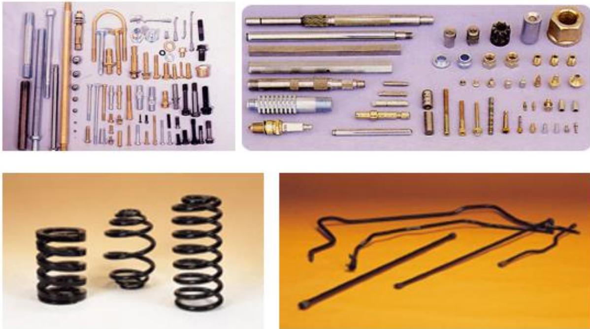
Figure 2. Application of CARBON & ALLOY STEEL Wire Rod