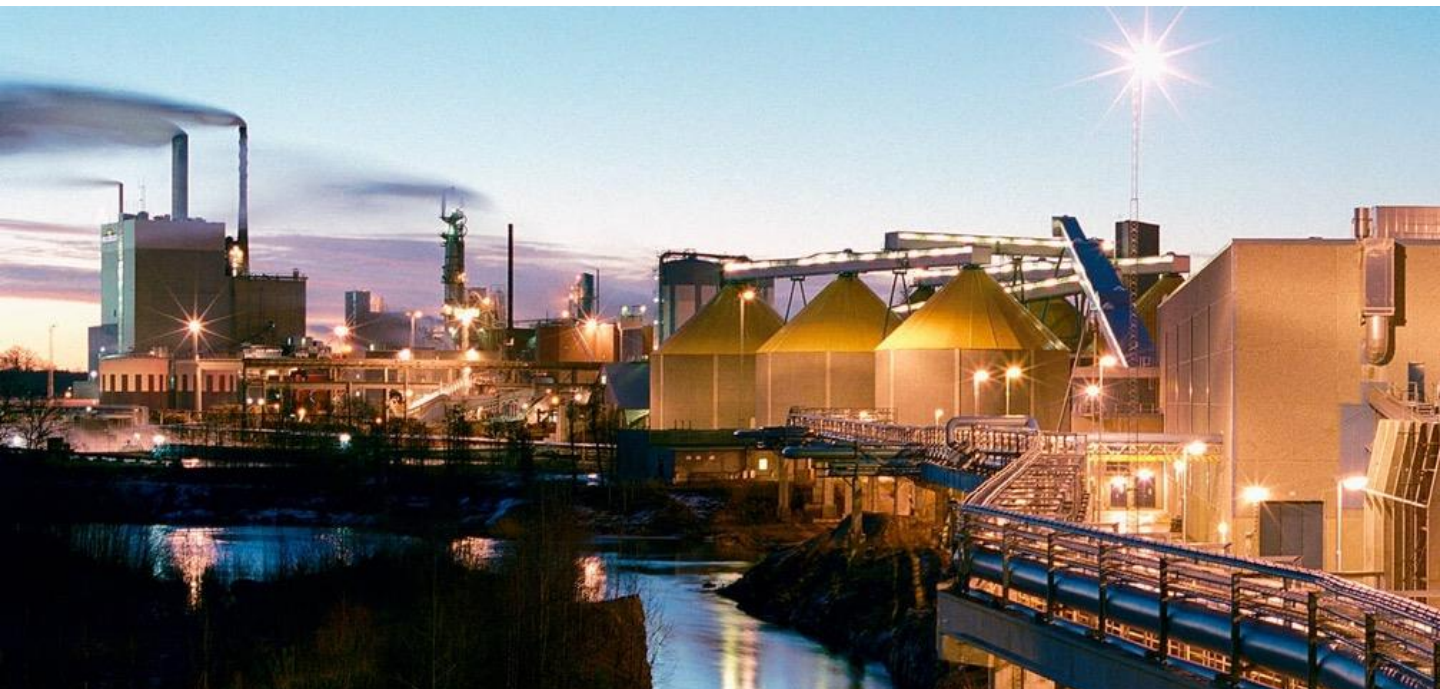
SKÄRBLACKA MILL PM4 – THE PRODUCTION SITE FOR FLUTE S

The product is manufactured from virgin fibres with addition of recycled fibres and chemicals that meet the relevant demands in FDA and BfR, and in accordance with good manufacturing practice. For further information please contact us at Billerud.