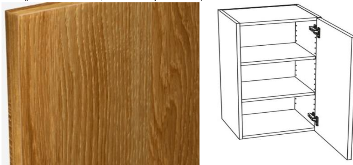
Figure 1, shows a picture of the veneered kitchen door with lacquer and its application in a kitchen cabinet.

The hinges and cabinet are not part of the EPD system boundary.