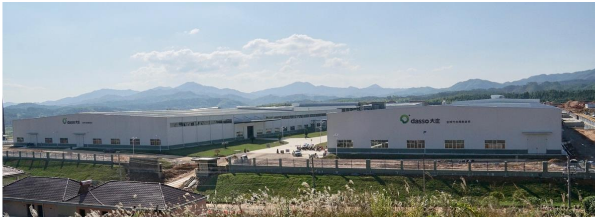
Figure 1 dasso factory in Jiangxi, China

dasso has now 8 manufacturing facilities and over 1000 employees, in addition to owning over 2,700 hectares of productive, sustainable bamboo forest in China. Besides, dasso has also established an independent R&D team with 50 people for product optimization and innovation. Up until now, 65 authorized patents, 24 innovative patents and 13 international patents have been acquired by dasso.