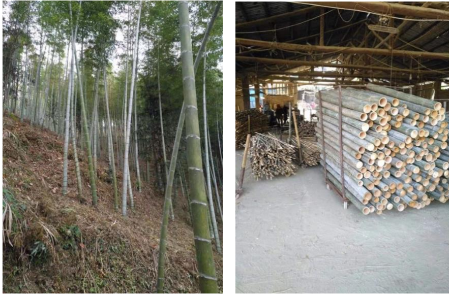
Figure 2 Bamboo culms and rough processing site near plantations

dasso Strand Woven Bamboo is a high-quality bamboo decking board with high density. It provides the natural look and feel of traditional bamboo products whilst combining excellent performance characteristics. In addition, the surface could be stained to the color of customers' choice prior to the final coating process. The possibility of color options provides the user the capability to integrate an environmentally friendly bamboo product into any design motif.