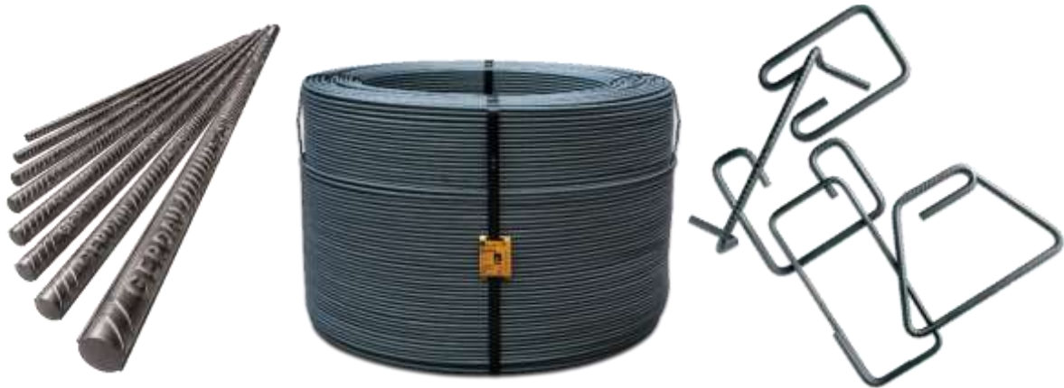
Figure 1: Rebars produced by Gerdau

Hot rolled reinforcing bars (rebars) produced with low-carbon steel. The rebars are weldable, with ribbed surface and provided as cut and bent bar, straight or bent bars and in rolls.