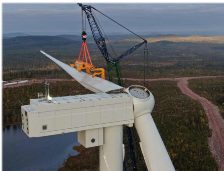
Figure 3.- 5.X Wind turbine generator assembly

For this EPD, Siemens Gamesa has calculated the environmental impacts arisen from the construction of a virtual 15 WTG wind farm model, as explained in section 2.2.1, and not from a single specific wind site. Siemens Gamesa holds reliable primary data on wind farm construction in a European context from two specific wind projects commissioned in 2019, which have been used as data sources. These are Ballestas windfarm (20 turbines) and El Valle windfarm (14 turbines), both located in Spain. These data have been adapted accordingly for the simulation of this virtual European 15 WTG wind farm