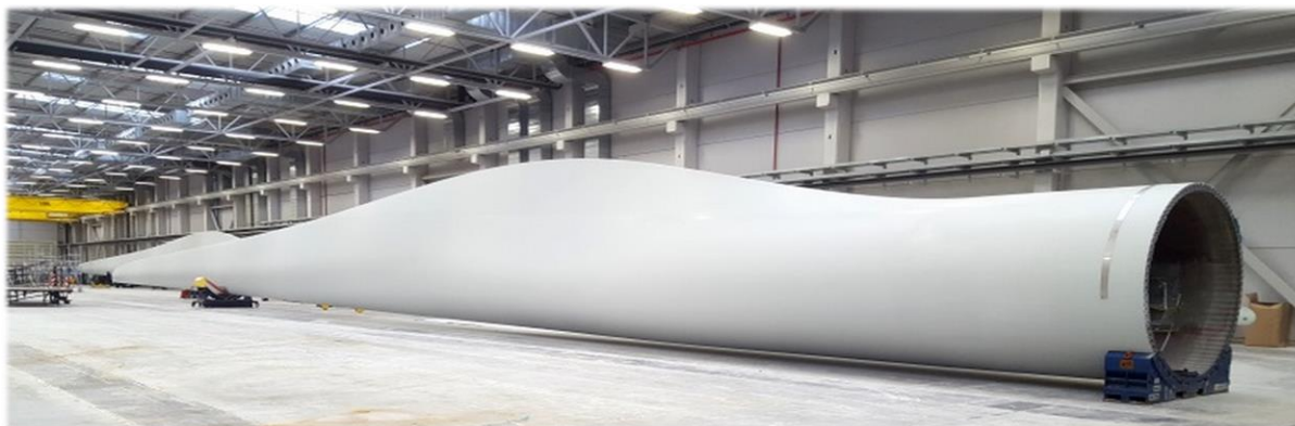
Figure 4.- Blade manufacturing in Siemens Gamesa

Finally, the core also contains a vital part of the wind turbine life cycle, which is the technical performance. Factors such as the annual energy production, the availability of the machine, the electrical losses during operation or the energy self-consumption of the turbine for its auxiliary systems, have a decisive influence on the environmental impact of the functional unit. These are also primary data directly provided by the manufacturer.