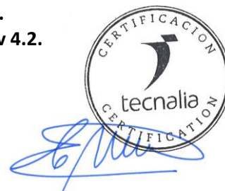
Carlos Nazabal Alsua Manager

Issued date / Fecha de emisión: 21/06/2022 Update date / Fecha de actualización: 21/06/2022 Valid until / Válido hasta: 19/06/2027 Serial Nº / Nº Serie: EPD0161000-E