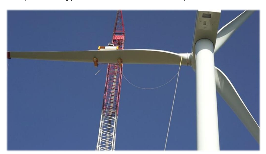
Figure 3: Wind turbine generator assembly

For this EPD, Siemens Gamesa has calculated the environmental impacts arisen from the construction of a virtual 8 WTG wind farm model, as explained in section 2.2.1, and not from a single specific wind site. Siemens Gamesa holds reliable primary data on wind farm construction in a European context from two specific wind projects commissioned in 2019, which have been used as data sources. These are Ballestas windfarm (20 turbines) and El Valle windfarm (14 turbines), both located in Spain. These data have been adapted accordingly for the simulation of this virtual European 8 WTG wind farm.