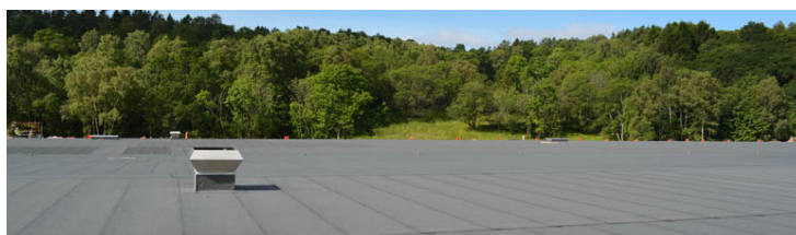
Figure 1. Example picture of installed Icopal Mono reinforced bitumen sheets.

Icopal Mono is a weldable, single-layer, high-quality roof waterproofing system based on SBS-modified bitumen. It fits all types of roof structures and is applicable for new roofing as well as re-roofing of existing roofs. It is attached through welding and fastened mechanically. Icopal Mono is adapted to Nordic conditions, well tested and has an expected service lifetime of 40 years. The Icopal Mono reinforced bitumen sheets are available in several versions and in many colours to suit the surface and the appearance of the building. The system meets fire requirements according to BROOF (t2).