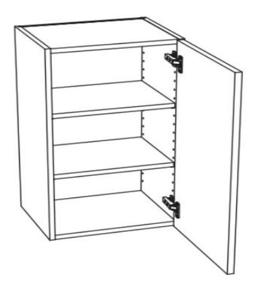
Figure 1, shows a picture of the UV-lacquered MDF kitchen door Plan and its application in a kitchen cabinet.