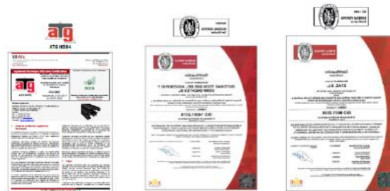
Image1. ISO 9001, ISO 14001 and ATG certifications STAC INSULATING PROFILES DIVISION

Production site: Polígono industrial Picusa s/n. 15900 A Matanza, Padron, A Coruna (Spain).