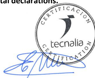
Carlos Nazabal Alsua Manager

Issued date / Fecha de emisión: 26/10/2022 Update date / Fecha de actualización: 26/10/2022 Valid until / Válido hasta: 25/10/2027 Serial Nº / Nº Serie: EPD0260300-E