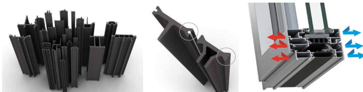
Image2. Polyamide profiles. Profiles with and without heat-adhesive bead. Profiles in the window frame.

Product description: The thermal break profile is made of PA66 reinforced with 25% fibreglass. These profiles are used as a thermal insulating material, sandwiched between the exterior and interior aluminium profiles of doors and windows, which acts as a barrier to minimize the energy transfer between the exterior and the interior.