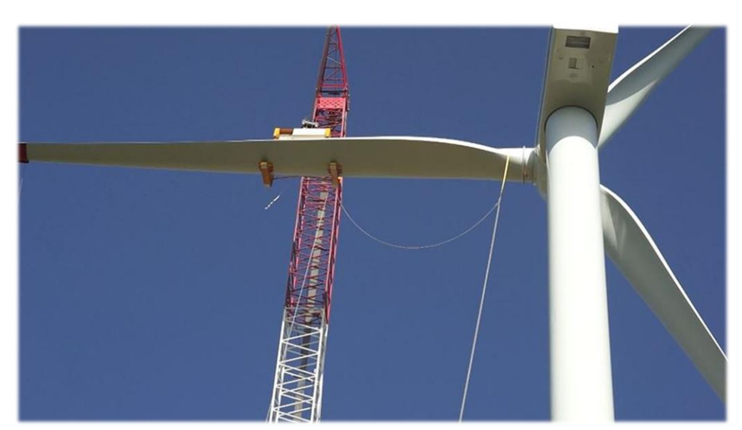
Figure 3: Wind turbine generator assembly

For this EPD, Siemens Gamesa has calculated the environmental impacts arisen from the construction of a virtual 8 WTG wind farm model, as explained in section 2.2.1, and not from a single specific wind site. Siemens Gamesa holds reliable primary data on wind farm construction in a European context from two specific wind projects commissioned in 2019, which have been used as data sources. These are Ballestas windfarm (20 turbines) and El Valle windfarm (14 turbines), both located in Spain. These data have been adapted accordingly for the simulation of this virtual European 8 WTG wind farm.