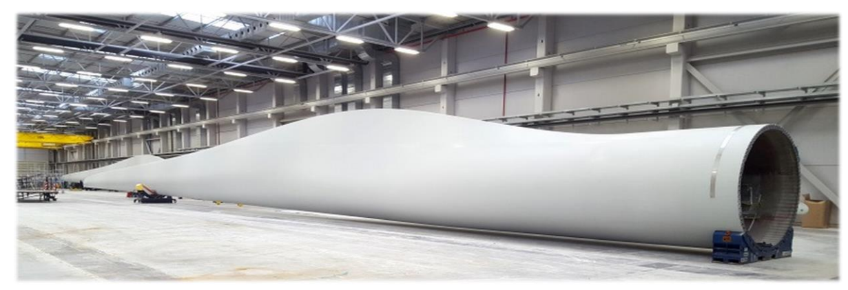
Figure 4: Blade manufacturing in Siemens Gamesa

Finally, the core also contains a vital part of the wind turbine life cycle, which is the technical performance. Factors such as the annual energy production, the availability of the machine, the electrical losses during operation or the energy self-consumption of the turbine for its auxiliary systems, have a decisive influence on the environmental impact of the functional unit. These are also primary data directly provided by the manufacturer.