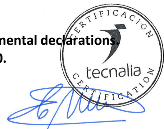
Carlos Nazabal Alsua Manager

Issued date / Fecha de entrada en vigor: 17/07/2024 Update date / Fecha de actualización: 17/07/2024 Valid until / Válido hasta: 15/07/2029 Serial N° / Nº Serie: EPD0971300-E