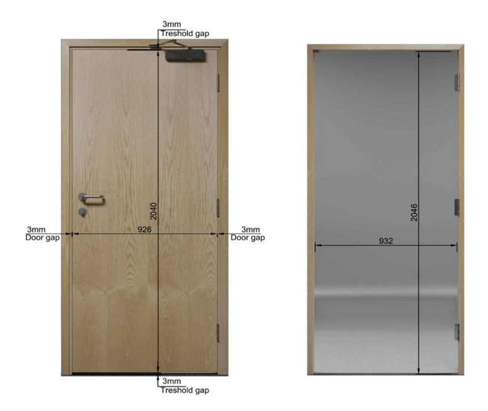
Figure 1: Dimensions of door and required door frame

commonly purchased sizes in the UK and it is a common size used by other manufacturers across Europe. Data would not be available on the installation of the door if the sizes in the EN17213 were reported on.