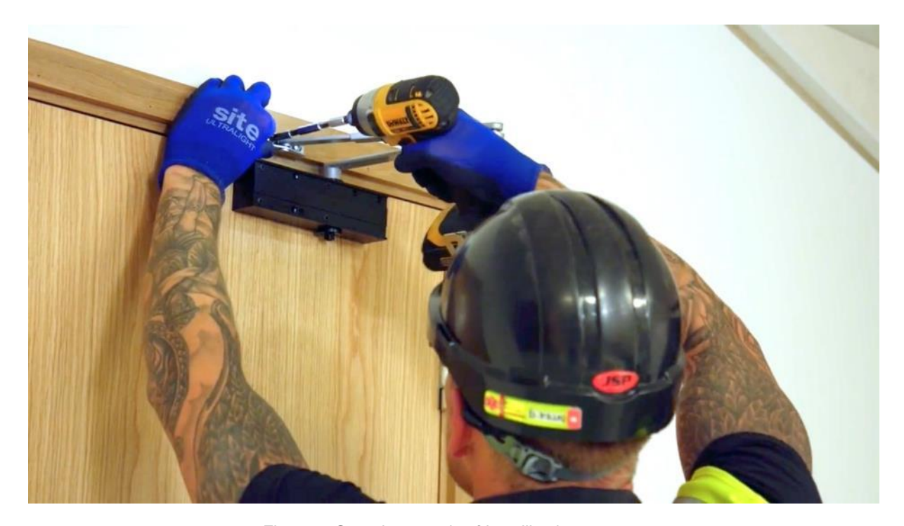
Figure 6: Generic example of installing ironmongery