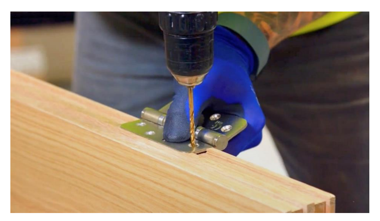
Figure 4: Generic example of fitting the hinges