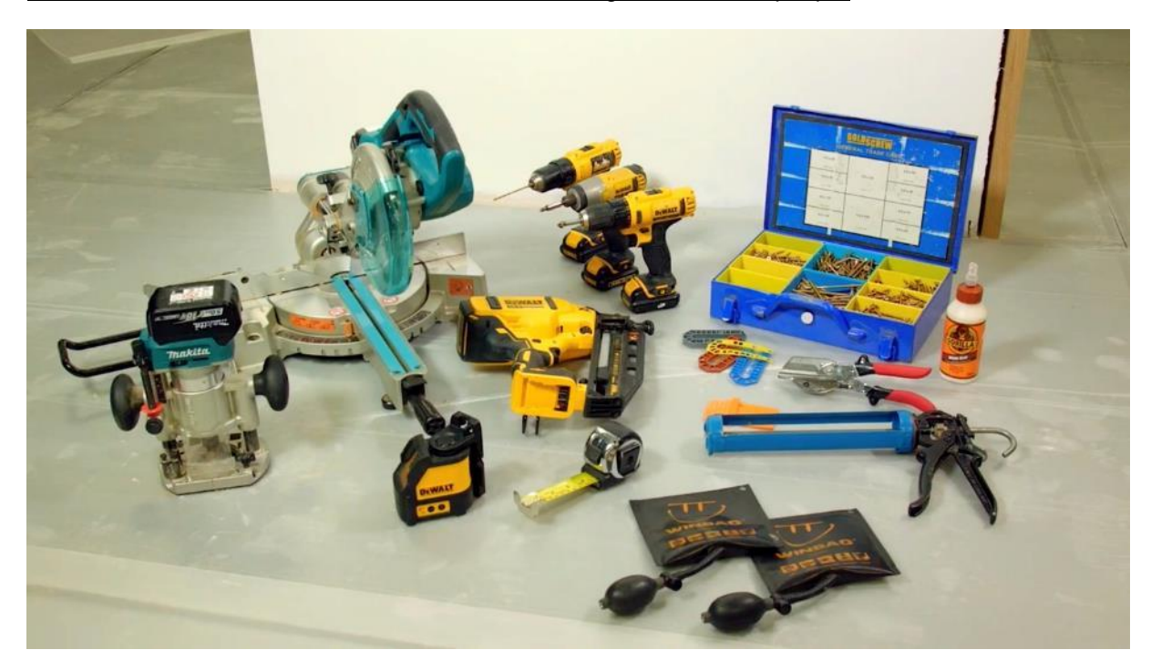
Figure 3: Section of tools required to fit a FD30 door.

To insure the correct installation of the door please follow the instruction at <a href="https://www.forza-doors.com/media/168306/forza-za-door-installation-guide-fd30-60-pdf.pdf">https://www.forza-doors.com/media/168306/forza-za-door-installation-guide-fd30-60-pdf.pdf</a>