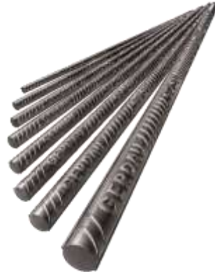
Figure 1: Rebars produced by Gerdau

Reinforcing Steel Bar Gerdau GG 50 (rebars) produced with low-carbon steel. The rebars are weldable, with ribbed surface and provided as cut and bent bar and straight bars.