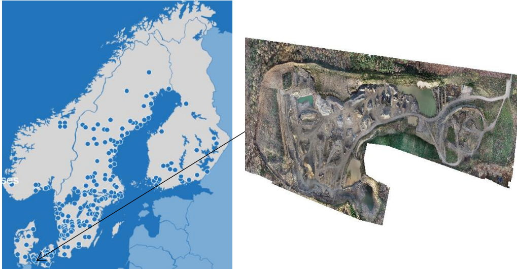
Figure 2: Map and picture showing the geographical location of the declared site.