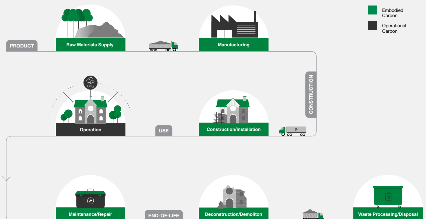
FIGURE 1 PRODUCT LIFE CYCLE

Our line of responsibly produced products are high quality and built to last, delivering long-term value for building professionals and homeowners, whilst helping builders to reduce the environmental impact of their builds.